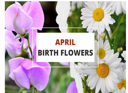
DAISIES AND SWEET PEAS